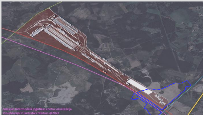
Salaspils Intermodālā loģistikas centra vizualizācija Vizualizācijai ir ilustratīvs raksturs © 2023