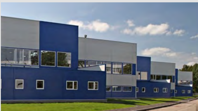
Nordic Industrial Park