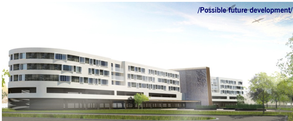
/Possible future development/