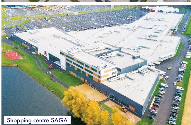
Shopping centre SAGA