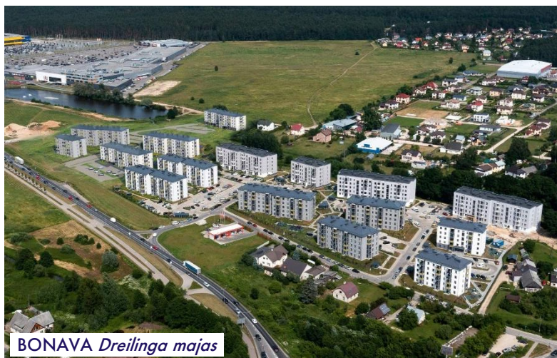
BONAFA Dreilinga mājās