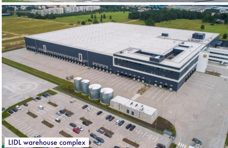
LIDL warehouse complex