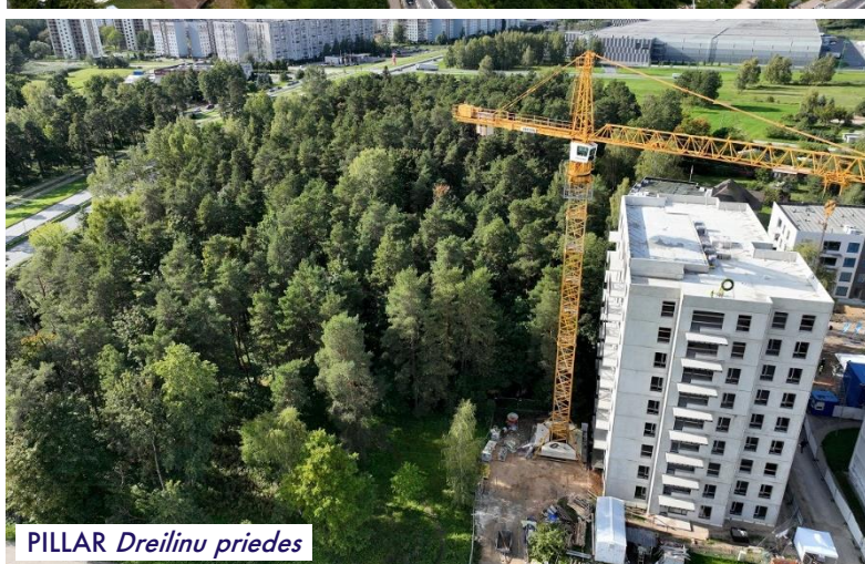
PILLAR Dreilinu priedes