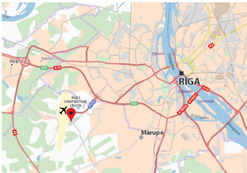
📍 Site macro location

The property is adjacent to the Riga International Airport – the largest air traffic centre in the Northern Baltic.